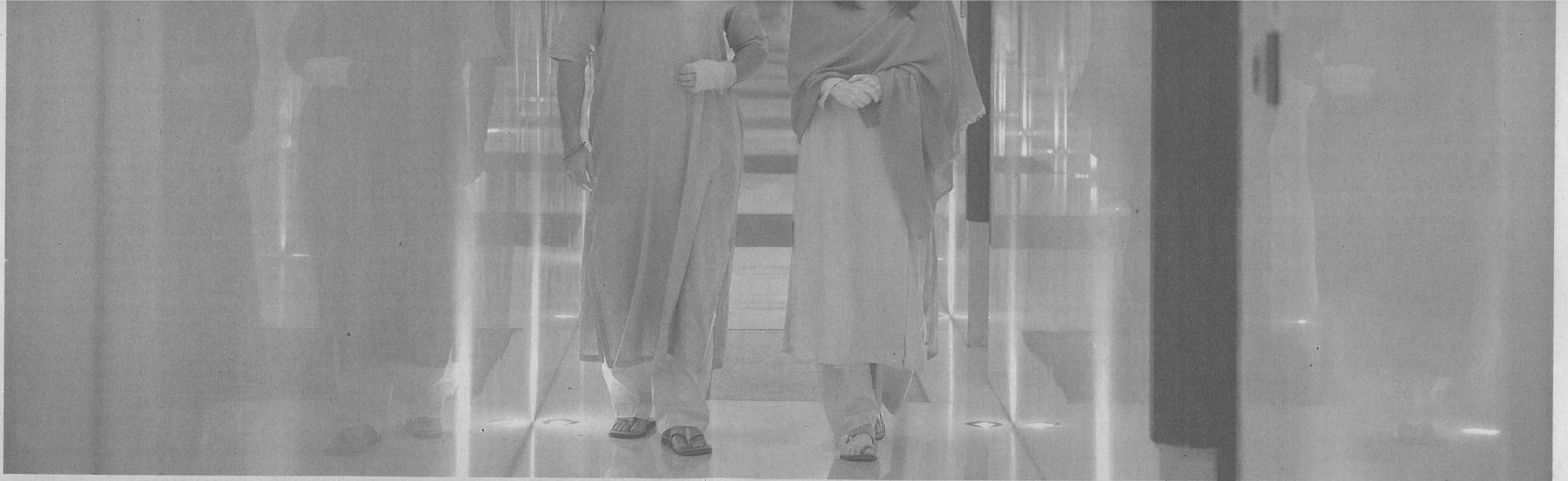
Above, Saif Ali Khan, left, and Kalki Koechlin in Season 2 of Netflix's "Sacred Games," a popular crime thriller. Below left, Sobhita Dhulipala in Amazon's "Made in Heaven," and right, Vineet Kumar Singh in "Bard of Blood," also on Netflix.